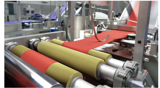
Extracting, Padding, Spreading, Compacting and Folding

As garment retailers demand for lower shrinkage and torque “in-garment” the Hydro-Sizer makes it possible to meet the standards easily with no additional processing costs.